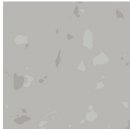
HL09 grey day