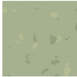
HL10 sweet dill