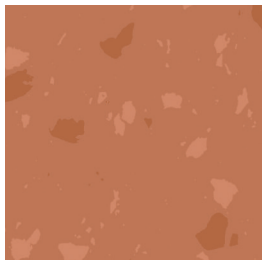
HL14 calm clay