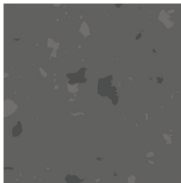
HL01 river stone