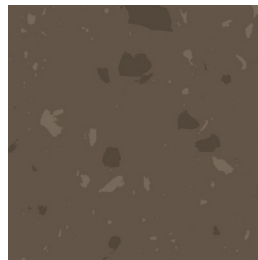
HL02 hot cocoa