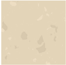
HL05 wheat fields