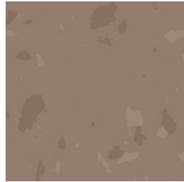
HL07 brown earth