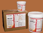
EW-710 Epoxy Modified Urethane Adhesive