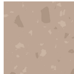
HL04 warm tea