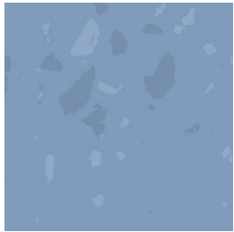
HL11 blue sky