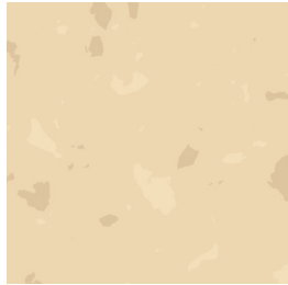
HL06 blonde bee