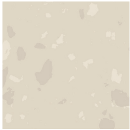
HL08 simple salt