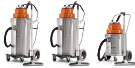
S 13 S 11 A 2000 A 1000